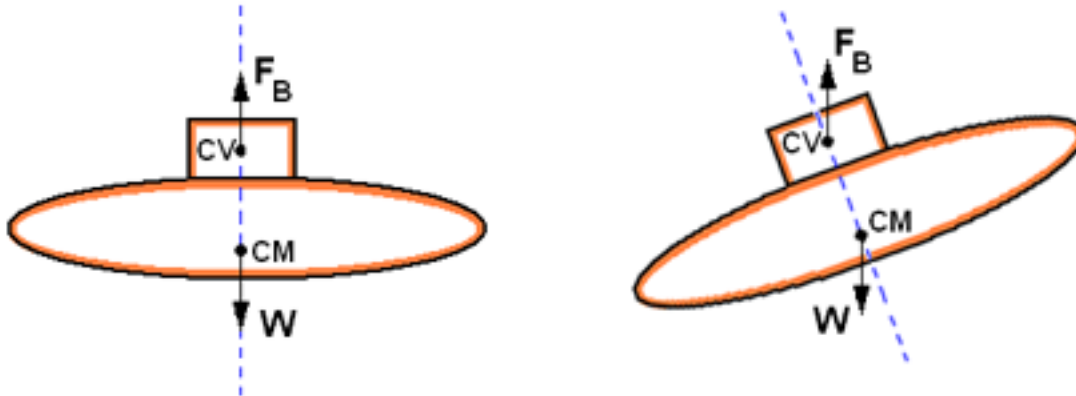
Figure 1: The hydrostatic forces on a submerged body ( CM = center of mass, CV = center of volume or buoyancy).

Having derived Archimedes Principle we now address the issue of the equilibrium of a submerged body such as the submarine depicted in Figure 1 or the balloon depicted in Figure 2. When both the body