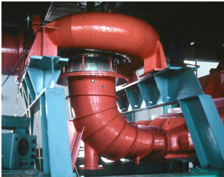
Figure 3: Turbine test facility at the Central Water and Power Research Station (CWPRS) near Pune, India, with a Francis turbine installed.