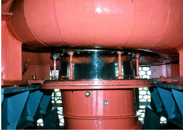
Figure 3: Turbine test facility at the Central Water and Power Research Station (CWPRS) near Pune, India, with a Francis turbine installed.

Most turbine testing is conducted in large facilities that can accommodate the full scale machinery despite the fact that this often inhibits detailed investigation of the basic mechanisms of cavitation in these machines. An example of such a facility is the turbine test facility pictured in Figure 3; cavitation can be observed through the transparent housing surrounding the draft tube.