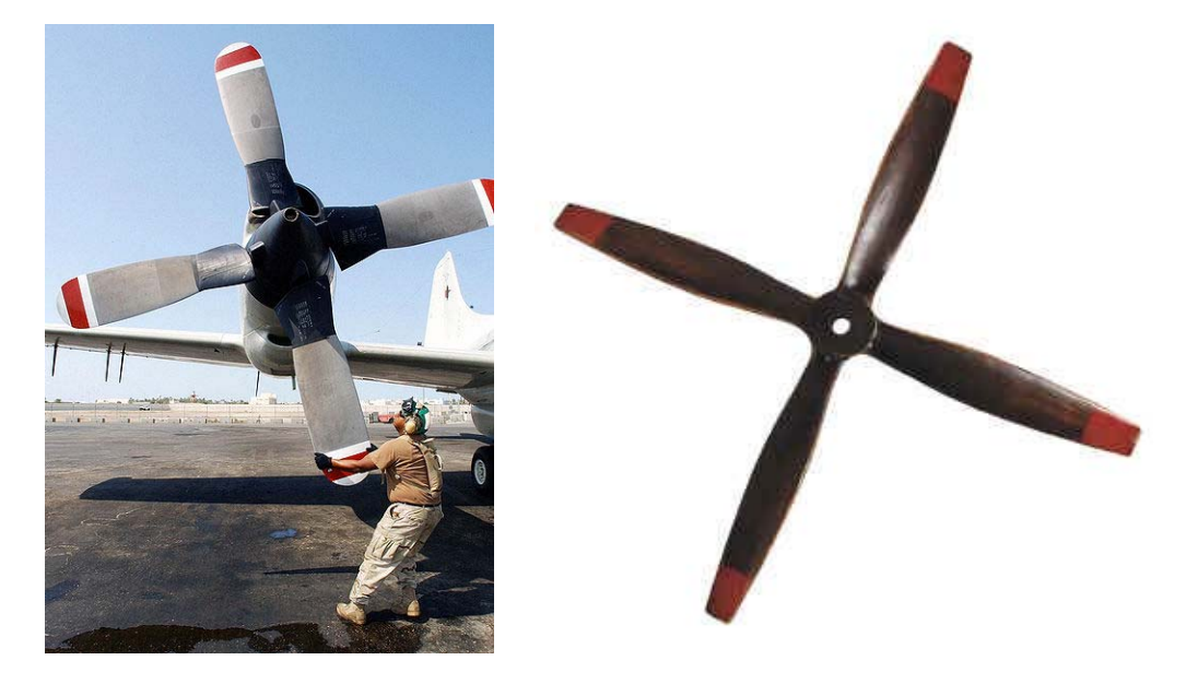
Figure 1: Left: Hamilton Standard 54H60 propeller on US Navy plane. Right: A typical high aspect ratio propeller, AP156-hi.

Though propellers were first fitted on ships in the 1830s, it was really the Wright brothers who began serious optimization of their design because of their critical need for lightweight and efficient propellers for their pioneering airplanes. Like the wings of an aircraft, propeller blades are most effective when they have a high aspect ratio, that is to say they are long and thin as exemplified by the aircraft propellers in Figure 1. However, as with wings, structural limitations demand greater strength and this constraint is particularly severe for marine propellers which, to be sufficiently strong and rugged, must have blades of much smaller aspect ratio as exemplified by Figure 2. As described in the following section, the design of a propeller is influenced by many factors that include not only the required thrust and structural strength but also the vulnerability and susceptibility to damage.