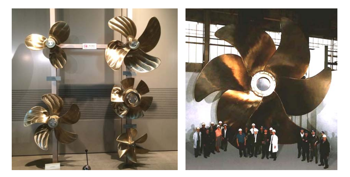
Figure 2: Left: Five different marine propeller designs. Right: 85 ton, bronze marine propeller.