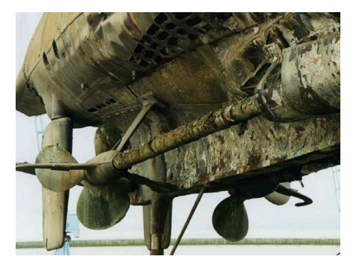
Figure 4: Left: Propellers on the salvaged U-boat, U-584.