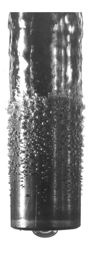
Figure 1: The evolution of convective boiling around a heated rod, reproduced from Sherman and Sabersky (1981).

The first analysis of film boiling on a vertical surface was due to Bromley (1950) and proceeds as follows. Consider a small element of the vapor layer of length dz and thickness, \delta(z) , as shown in figure 2. The temperature dif-