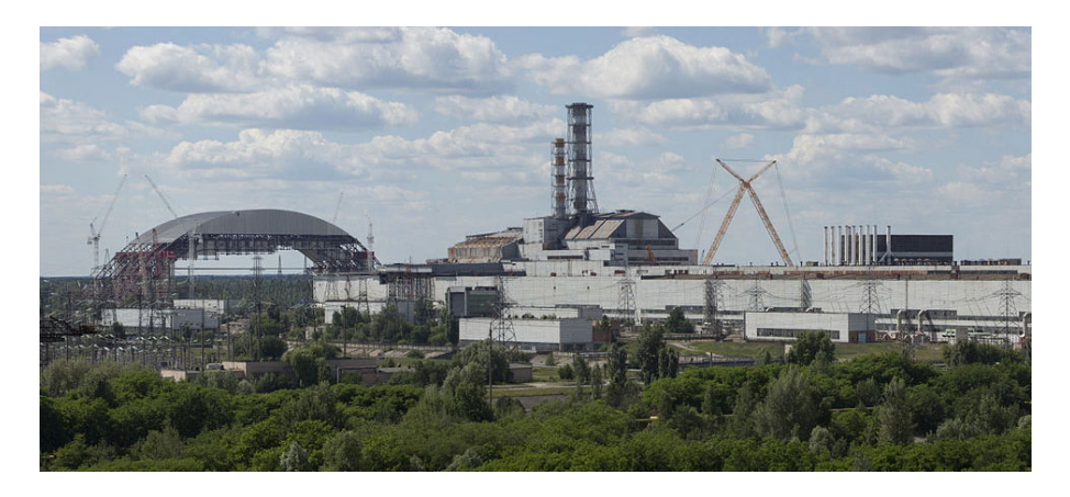
Figure 4: Cylindrical entombment structure (left) being prepared for installation over the damaged Chernobyl reactor (center).

Figure 3: Map of the radioactive deposits (radioactivity of {}^{137}Cs in the soil in kBq/m^2 ) on Apr.27, 1986, and the 30 km exclusion zone around the Chernobyl reactor (UNSCEAR 2000).