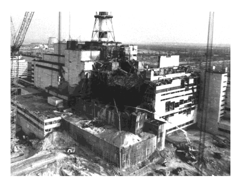
Figure 2: Photograph of the Chernobyl accident site taken shortly after the accident (USNRC 2006).

a huge steam explosion (see section 7.6.4) that lifted the top off the reactor, blew off the building roof and sent a plume of radioactive gases and particulates high into the atmosphere. The intense fire in and exposure of the nuclear core not only resulted in destruction of the reactor and the death of 56 people but also caused radiation sickness in another 200-300 workers and firemen. It also contaminated a large area in Ukraine and the neighboring country of Belarus (see figure 3). It is estimated that 130,000 people in the vicinity of the reactor received radiation above international limits. The photograph in figure 2 demonstrates how extensive the damage was to the reactor building.