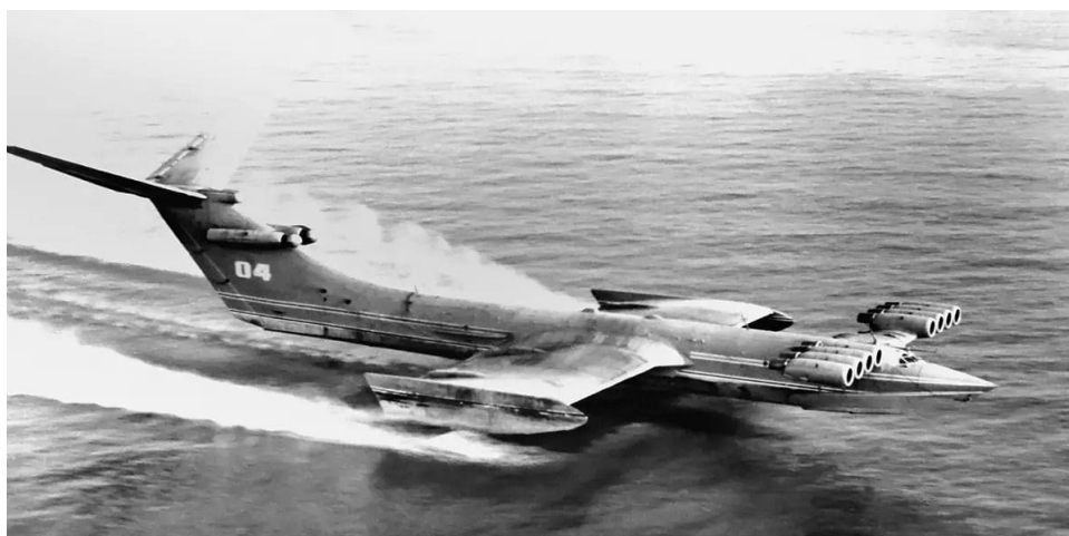
Figure 2: Photographs of the Russian Lun class ekranoplan beached near Derwent, Dagestan, on the shore of the Caspian Sea.