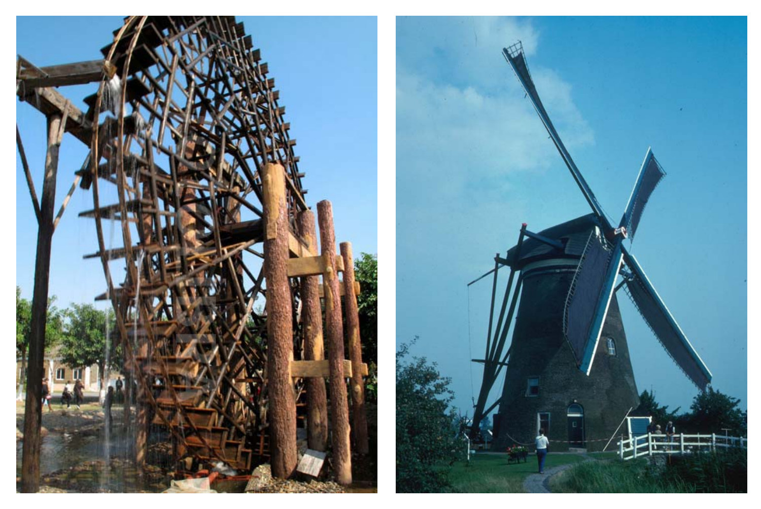
Figure 1: Left: Ancient Chinese water wheel of the kind used in the Han dynasty. Right: Modern windmill in the Netherlands.

Historically turbines were the first form of mechanical power to be developed to replace animal power. In ancient times water turbines took the form of wheels driven by water diverted from a stream or river source as depicted by the example in Figure 1 (left). In parallel, air turbines in the form of windmills were